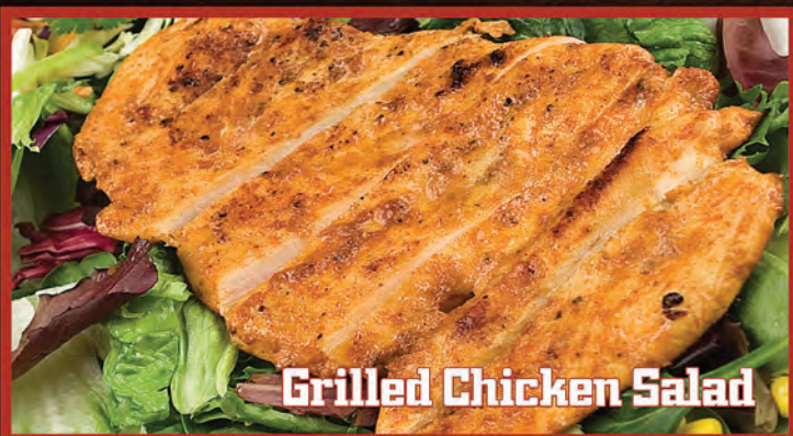
Grilled Chicken Salad