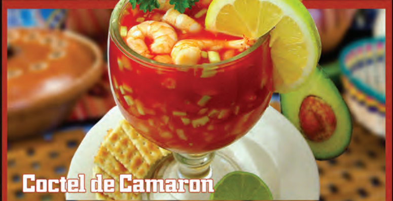
Coctel de Camaron