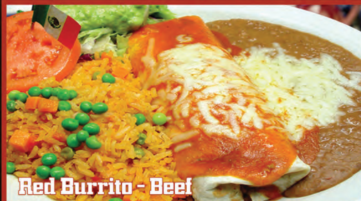
Red Burrito - Beef