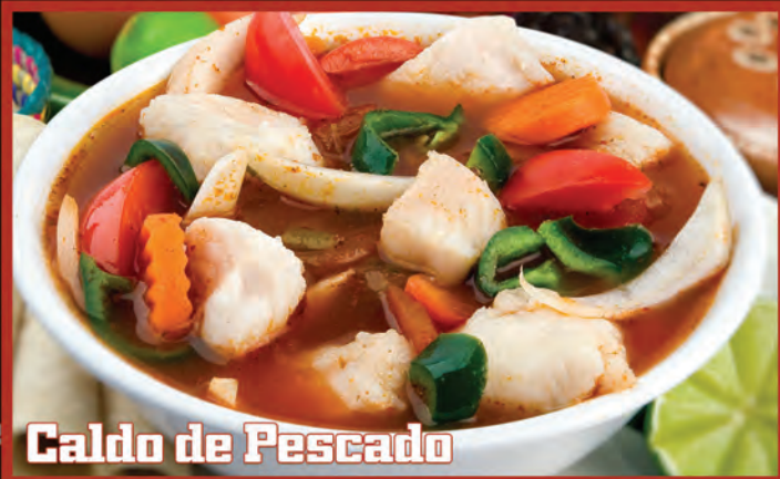
Caldo de Pescado