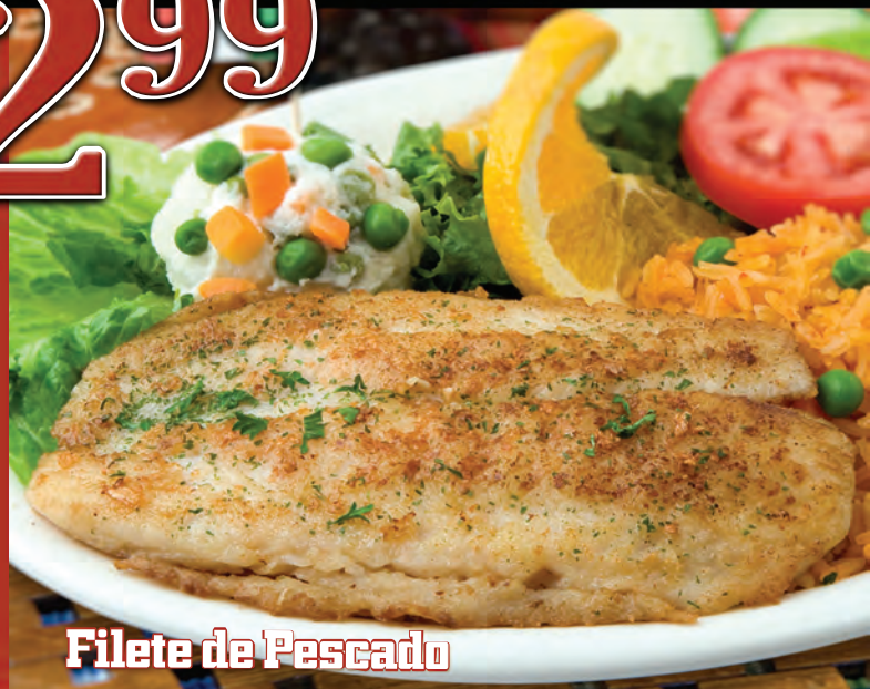
Filete de Pescado