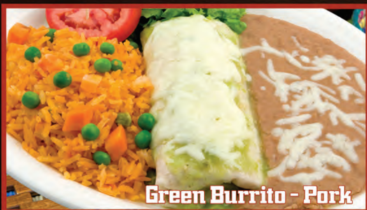
Green Burrito - Pork