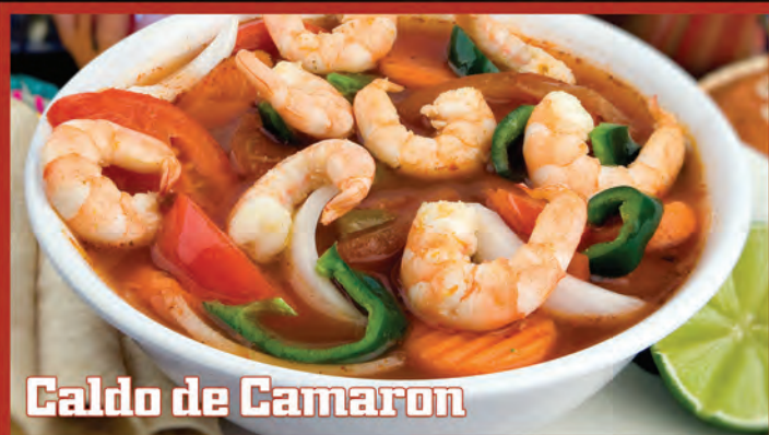
Caldo de Camaron