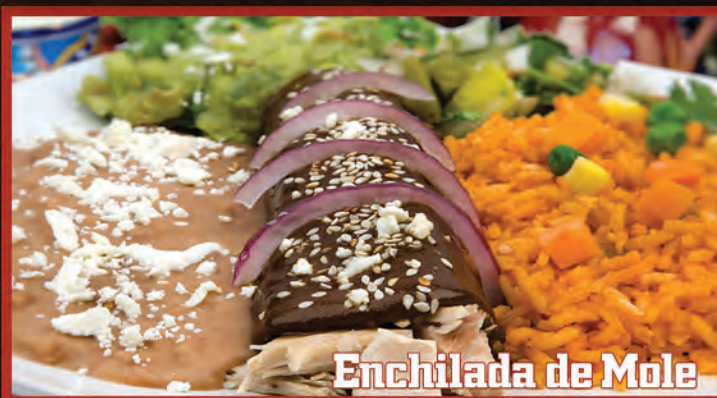
Enchilada de Mole