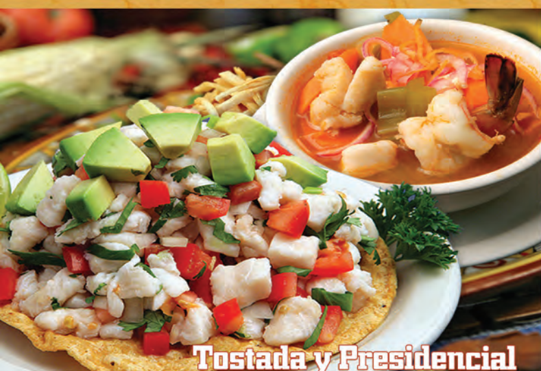
Tostada y Presidencial