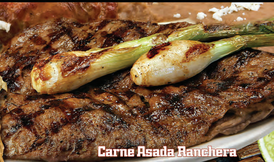
Carne Asada Ranchera