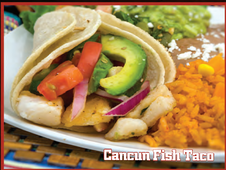
Cancun Fish Taco