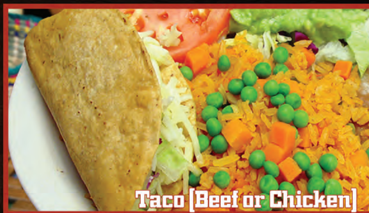
Taco (Beef or Chicken)