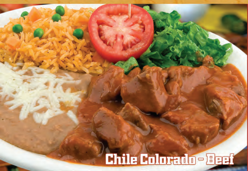
Chile Colorado - Beef