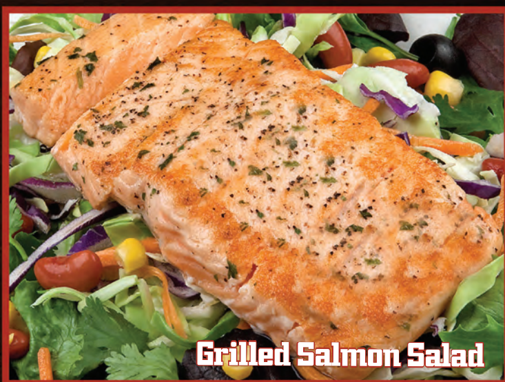
Grilled Salmon Salad