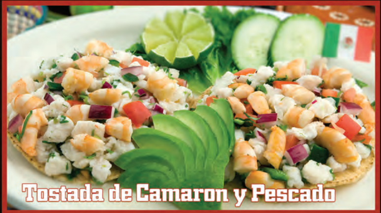
Tostada de Camaron y Pescado