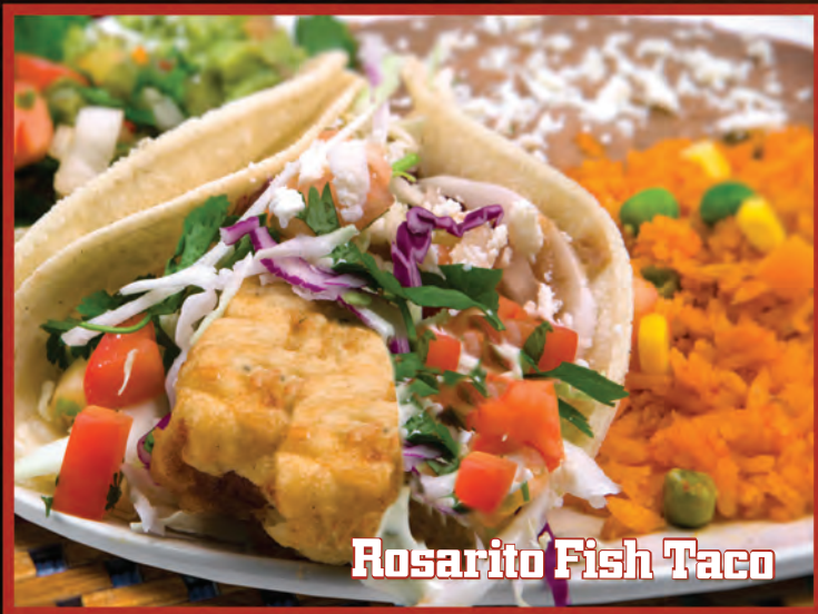
Rosarito Fish Taco