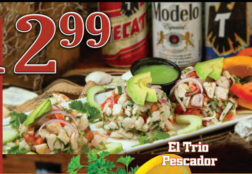
El Trio Pescador