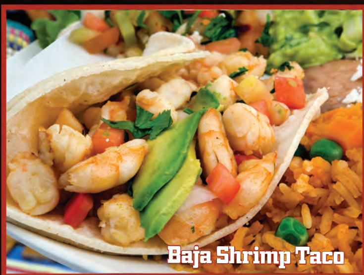
Baja Shrimp Taco