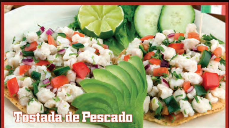
Tostada de Pescado