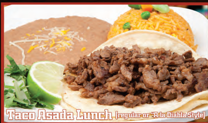
Taco Asada Lunch (regular or "A la Diabla Style")