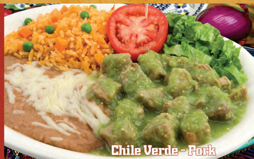
Chile Verde - Pork